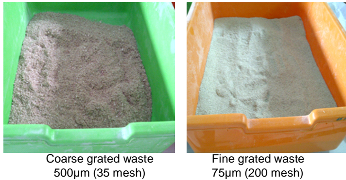
Figure 2. Agar solid waste that has been grated

obtain. Therefore, it is widely used as a filter and also for the immobilization of some active compounds (Ansari & Husain, 2012).