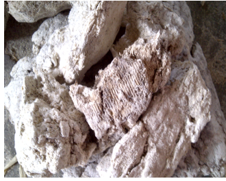
Figure 1. Solid waste from the agar industry